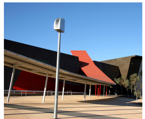
National Museum of Australia.