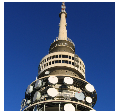
The Black Mountain Tower.