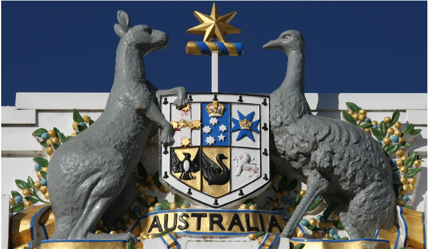
Australian Emu and Kangaroo emblem on old Parliament house - Canberra.