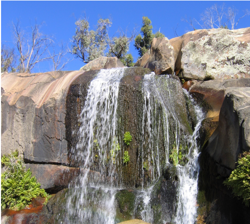
Gibraltar Falls.