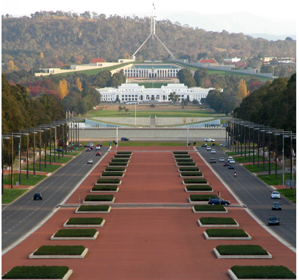
Anzac Boulevard.