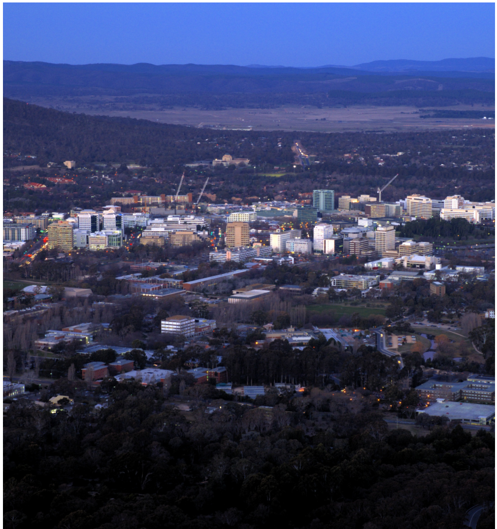
Canberra City.

Tourist Bureaus Canberra and Region Visitors Centre 330 Northbourne Avenue, Dickson ACT 2602 +61 02 6205 0044 crvc@act.gov.au www.visitcanberra.com.au