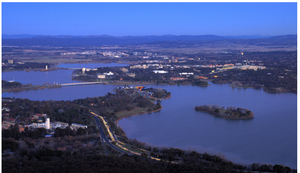
View over Canberra.