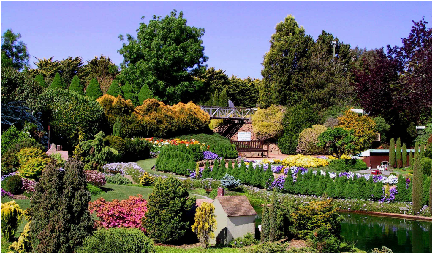
Garden in Canberra.