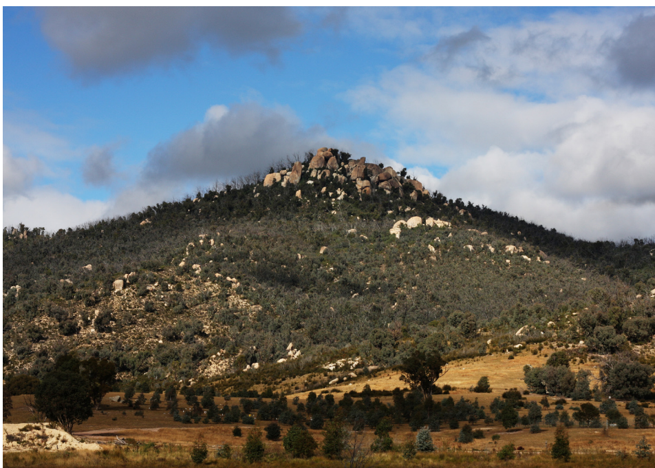
Gibraltar Rocks at the Tidbinbilla Nature Reserve.