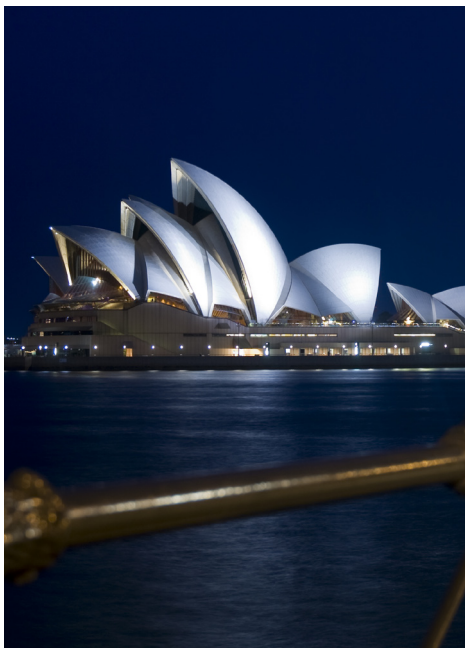
The Sydney Opera House.