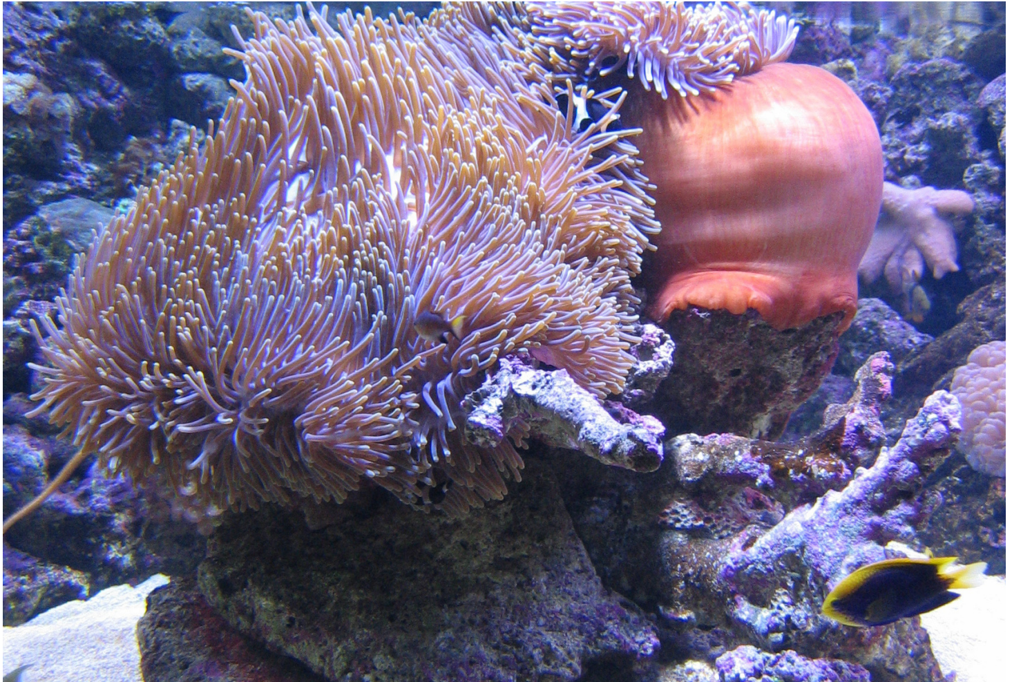
Enjoy the aquatic life and habitats at the Sydney Aquarium.