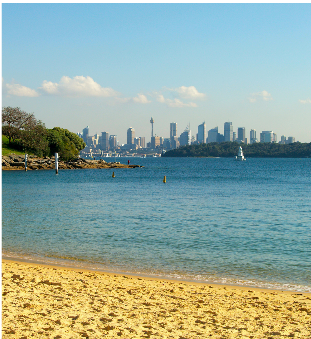
View of Sydney.

Official Tourist Information www.cityofsydney.nsw.gov.au