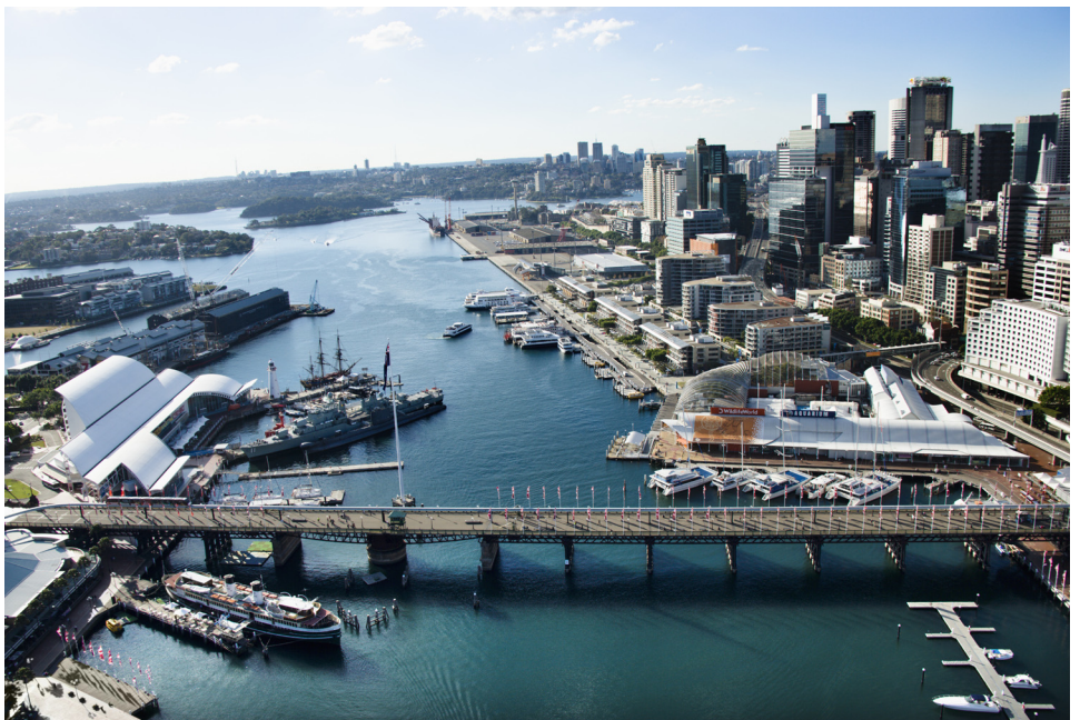
View of Darling Harbour.