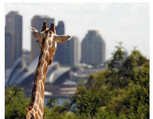
Visit Taronga Zoo.

Watsons Bay to The Gap. One of the most spectacular walks along the harbour begins at The Gap. The Gap is an ocean cliff at Watson's Bay and famous for it's natural beauty but stay on the paths for safety sake.