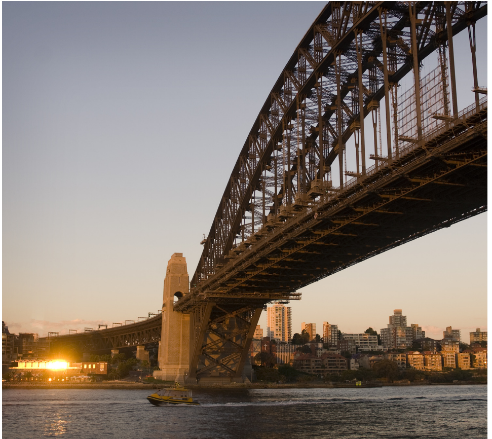
The Sydney Harbour Bridge.