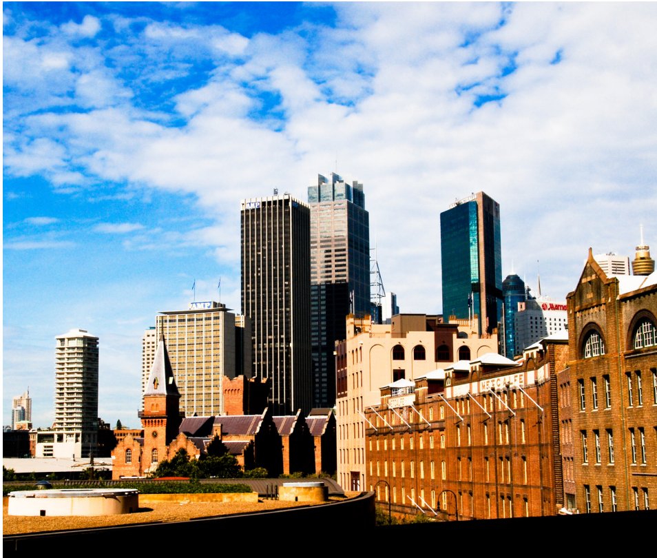
Rocks - The oldest and most historic area and named after its rough terrain.