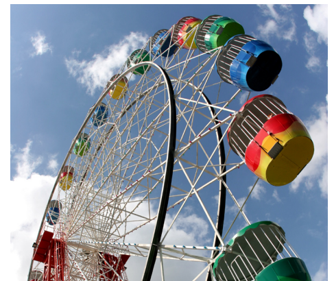
Luna Park is located near the Sydney Harbour Bridge.