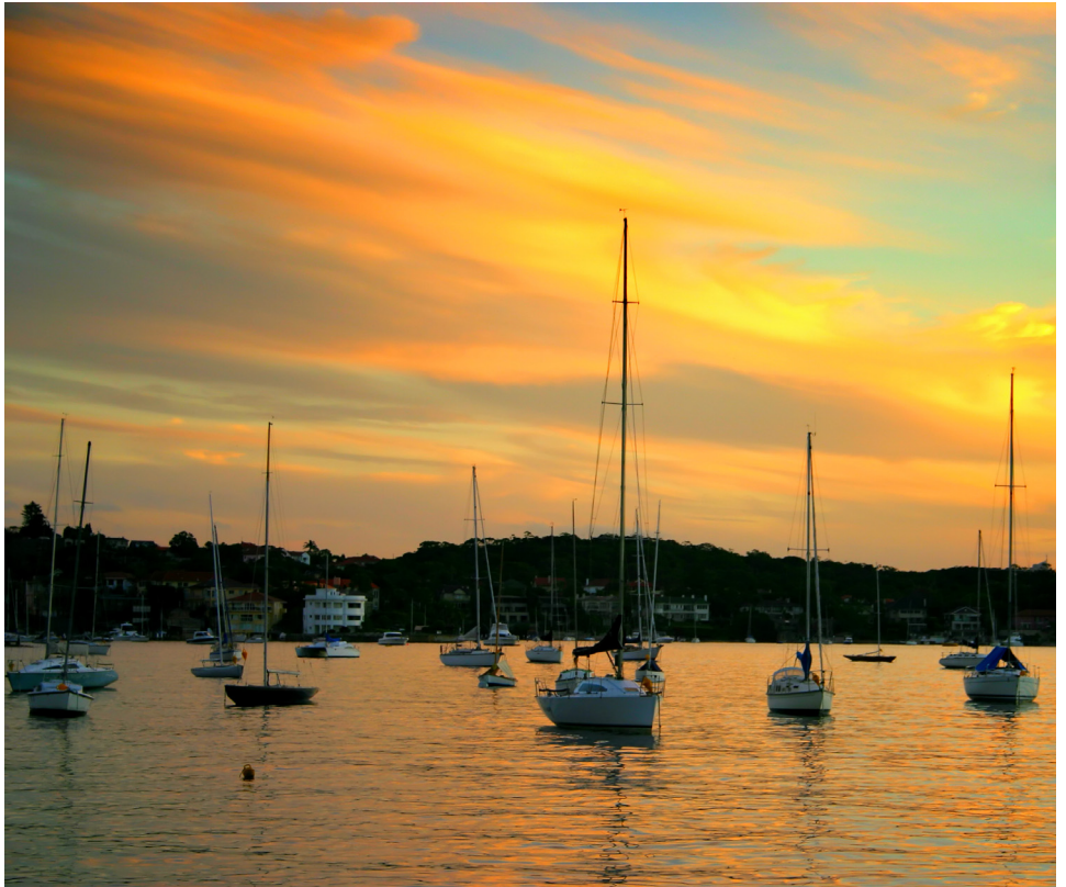
The Gap.