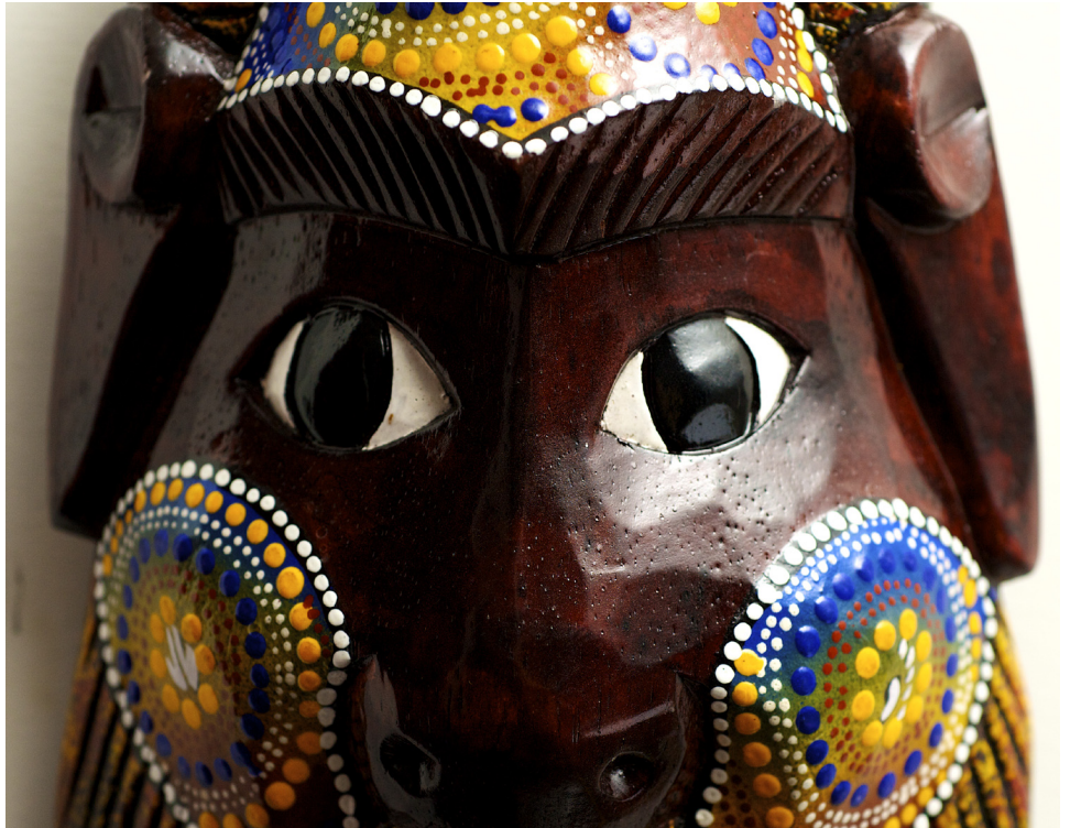
Australian Indigenous Art.