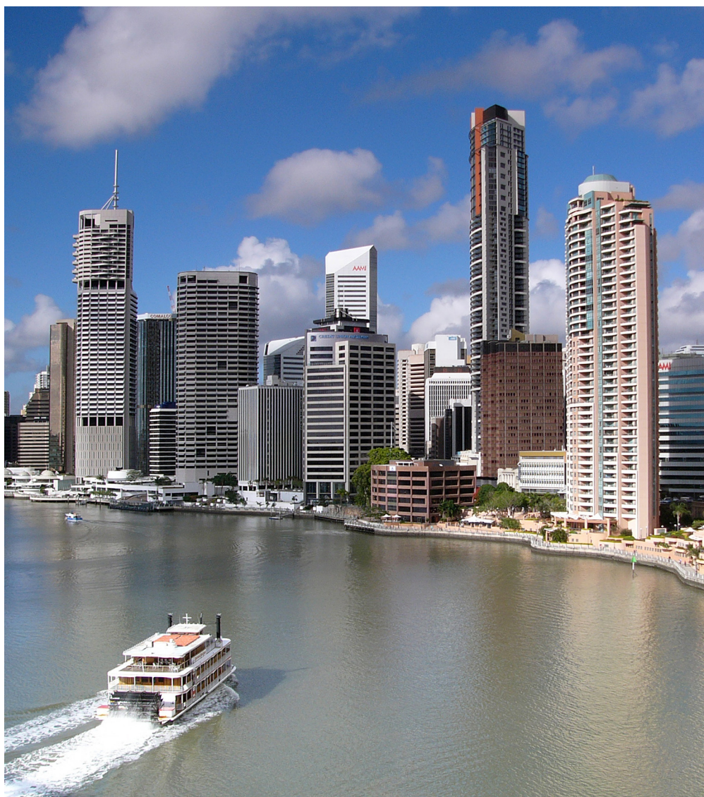
View of Brisbane.

Emergency 000 Police 000 Country Code +61 Area Code 7