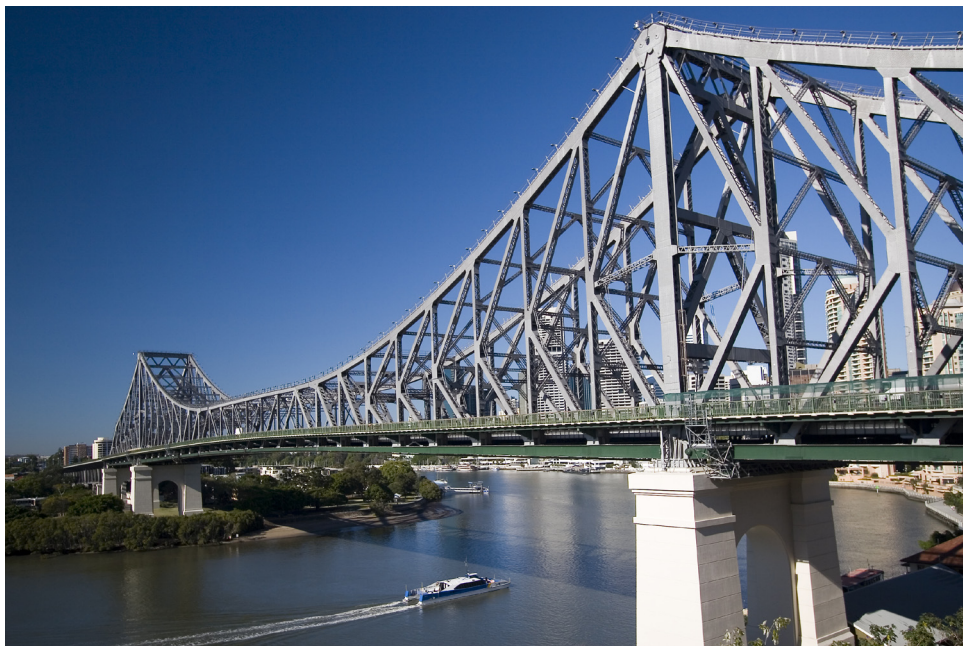
Story Bridge.