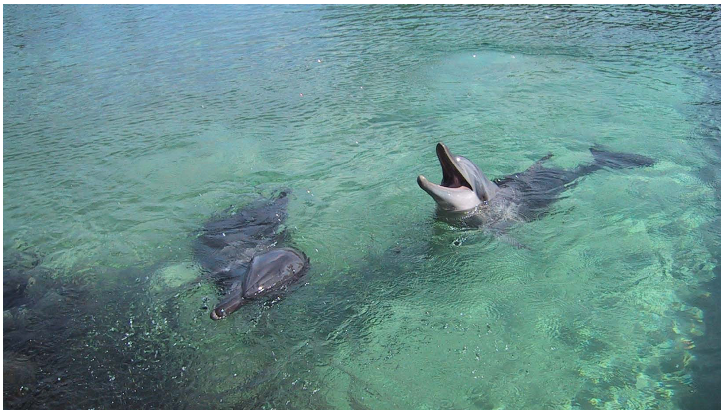
There is much to do at Dolphin Safaris.