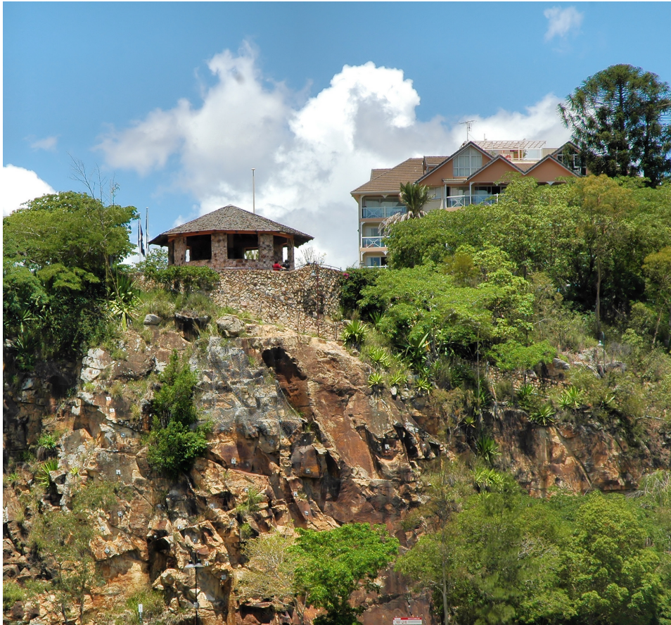
Kangaroo Point Cliffs.