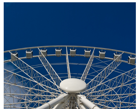
Wheel of Brisbane.

www.epa.qld.gov.au/projects/park/index.cgi?parkid=2