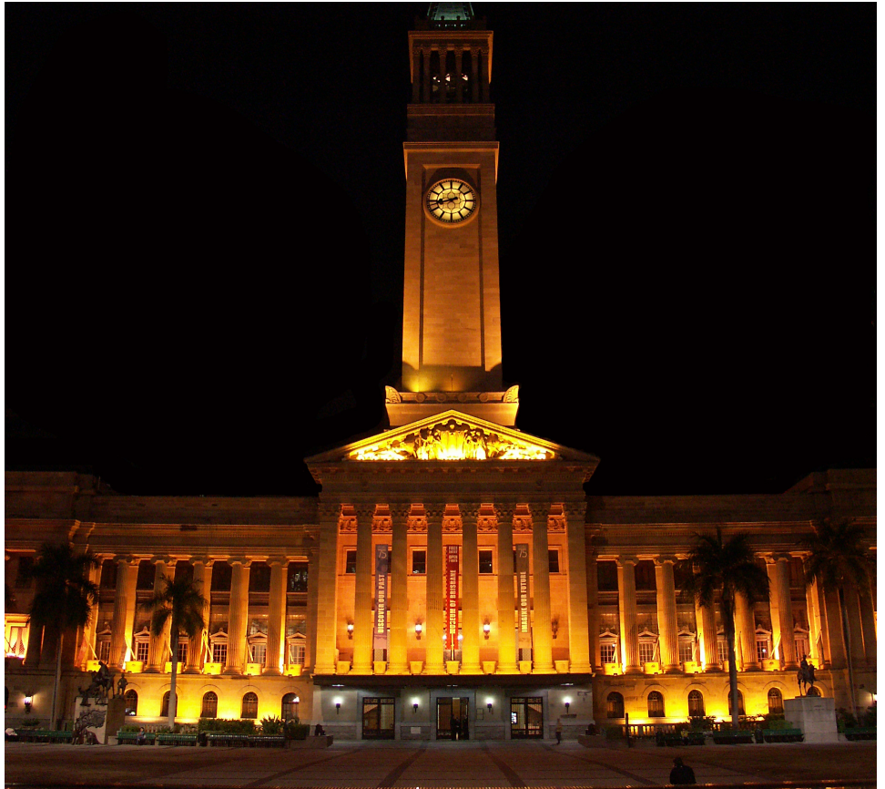
Brisbane City Hall.