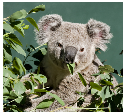
Brisbane Outback.