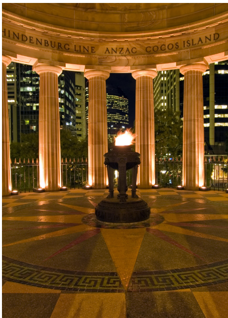
Anzac Square War Memorial.