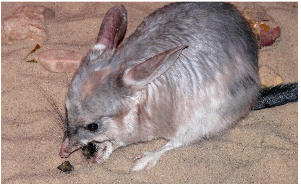
See the endangered Bilby at Warrawong Wildlife Sanctuary.