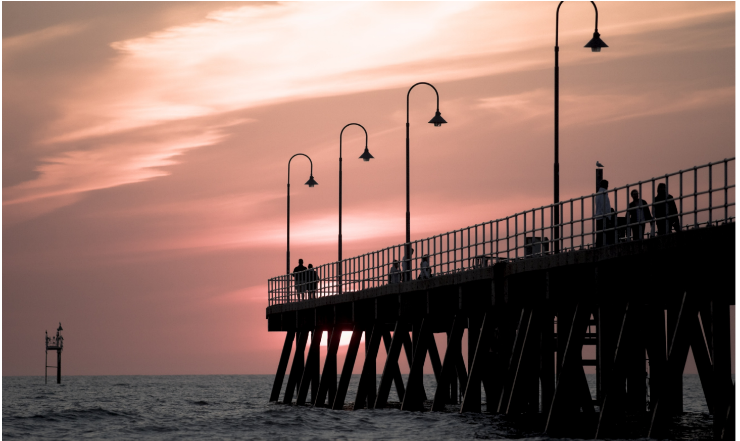
Glenelg Jetty, Adelaide.