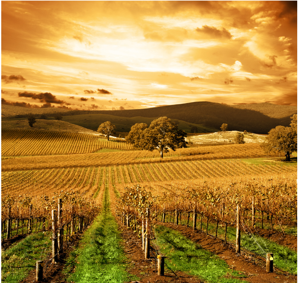
Autumn sunset over Adelaide Hills.

http://www.adelaidefestivalcentre.com.au/