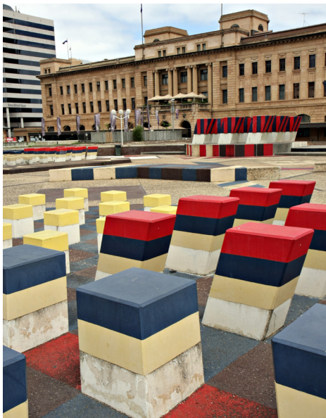
Adelaide Festival Center.