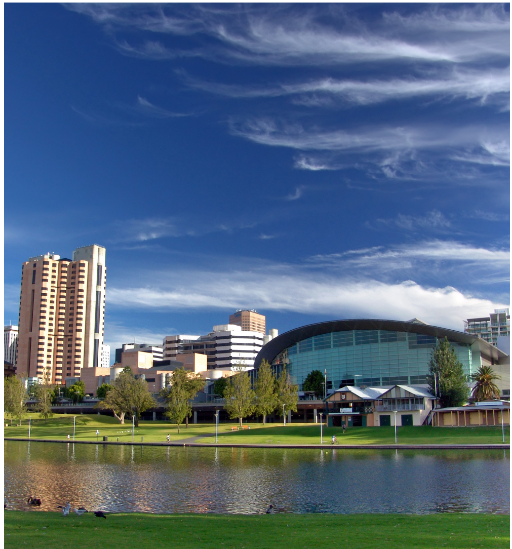
City of Adelaide - River Torrens.

Emergency 000 Police 000 Country Code +61 Area Code 8