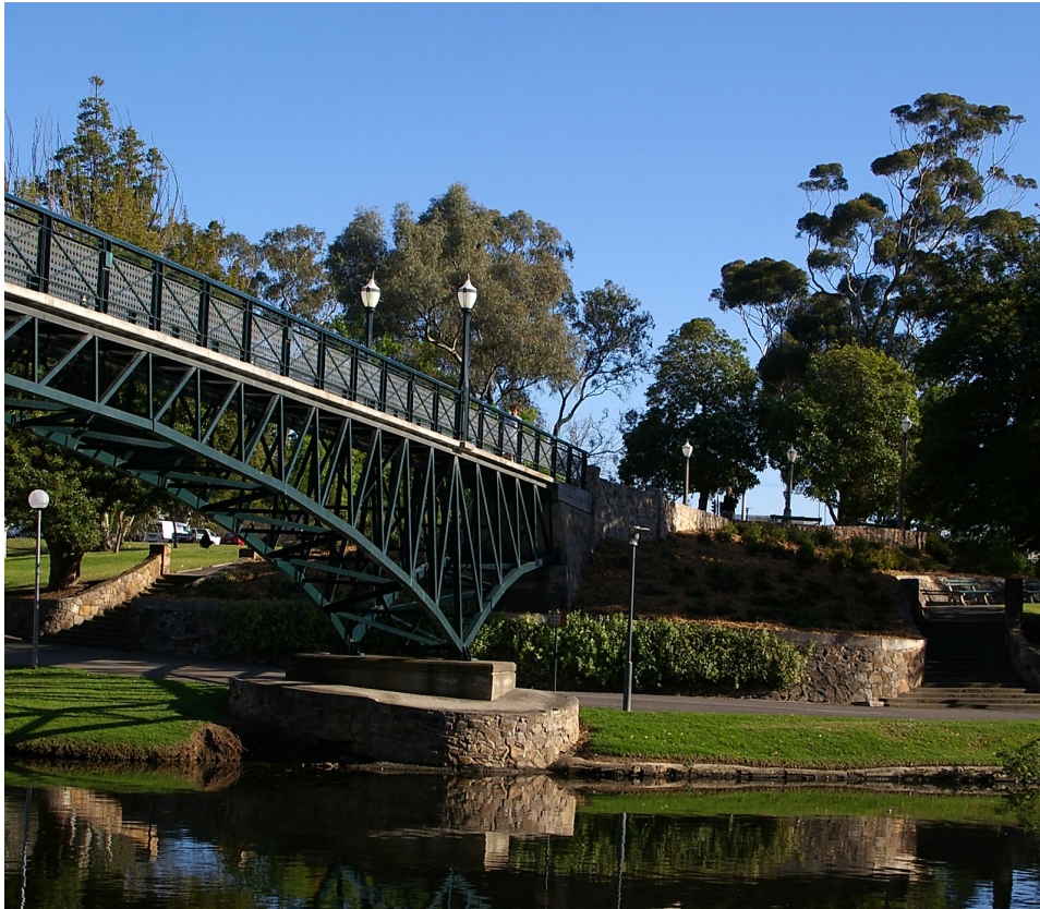
The River Torrens.