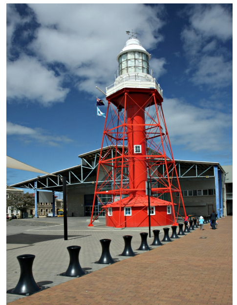
Port Adelaide Lighthouse.