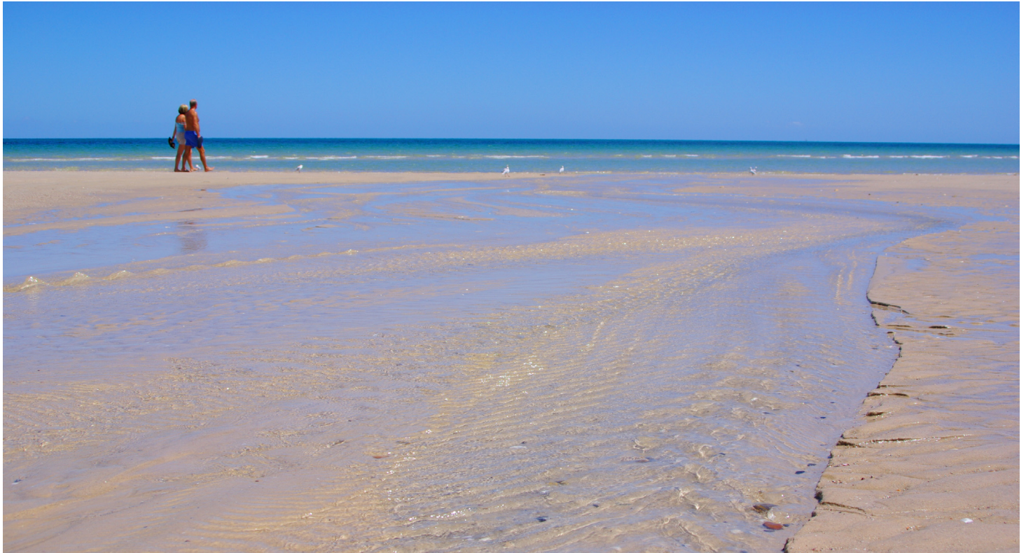
Henley Beach.