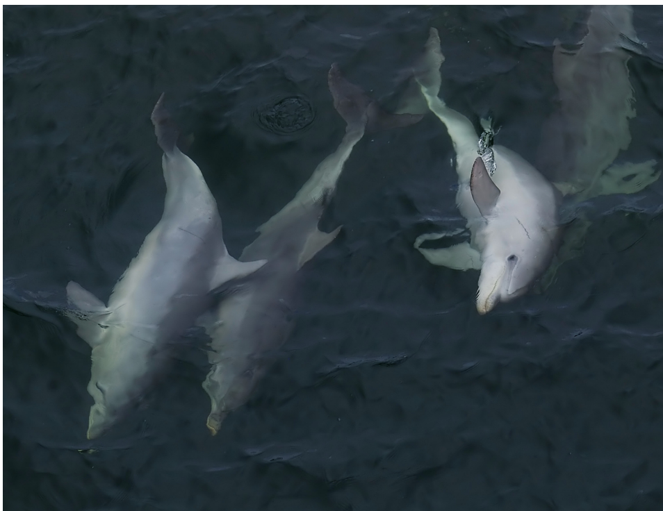
Enjoy the dolphins in Adelaide.