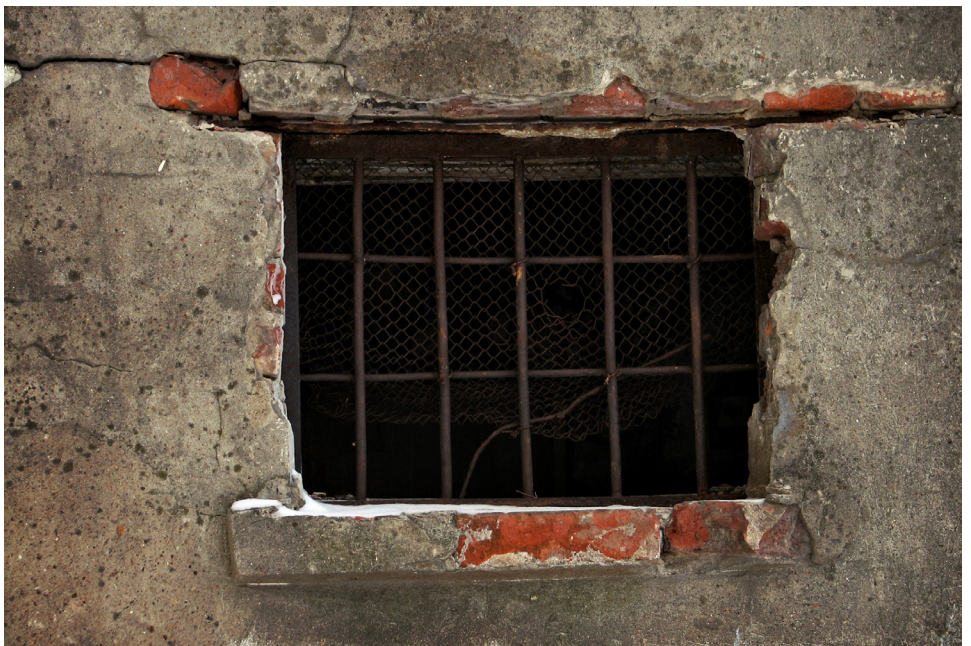
Old Melbourne Gaol, 19th Century prison.