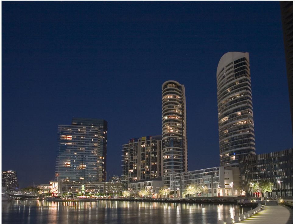
Melbourne, Australia, Docklands.