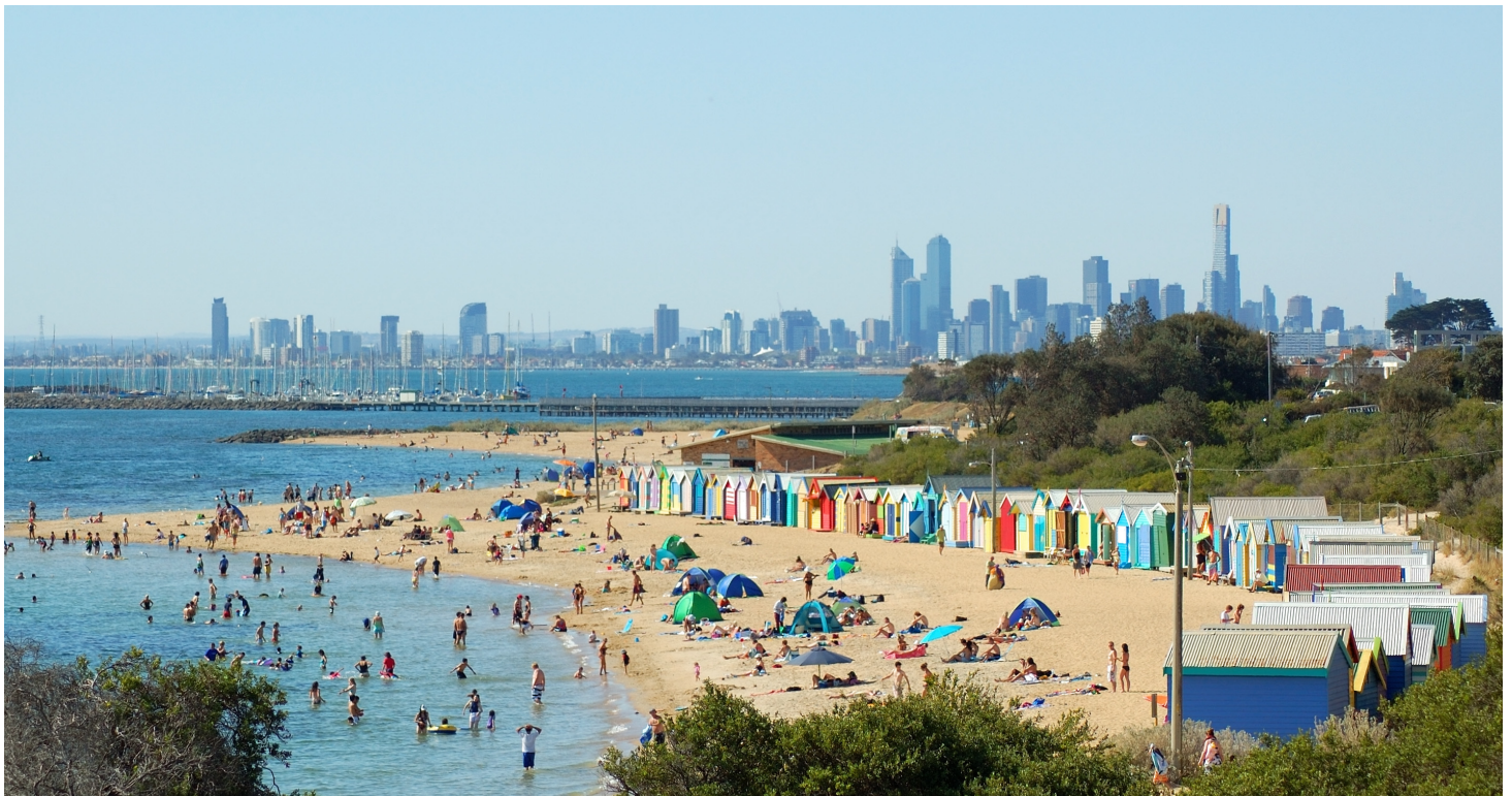
Melbourne Beach in the summer.