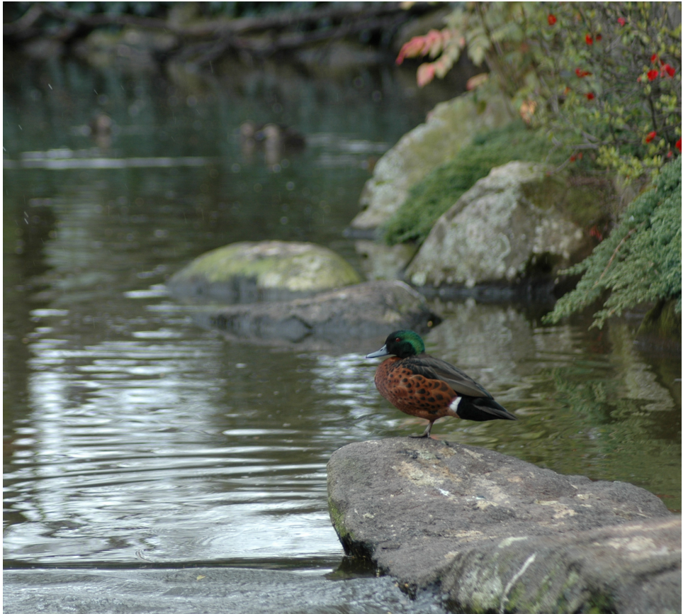
The Japanese Garden at the Melbourne Zoo.