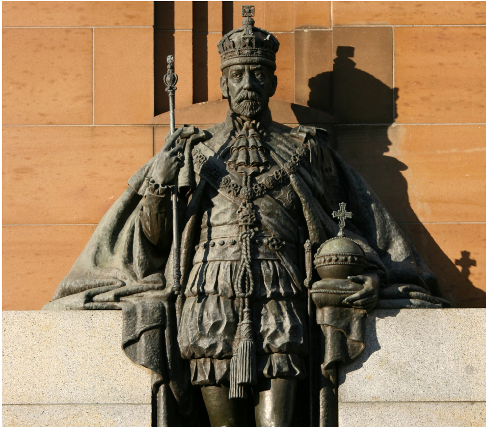
King Edward Statue - Kings Domain.