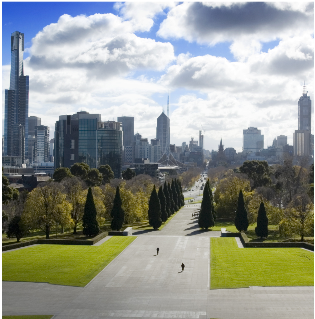
The park pathway leading into the heart of the city. Memorial Gardens, Melbourne, Australia.

Emergency 000 Police 000 Country Code +46 Area Code 3