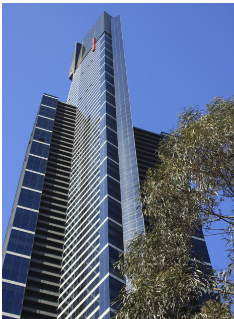
Melbourne, Australia's tallest residential building, Eureka Tower.