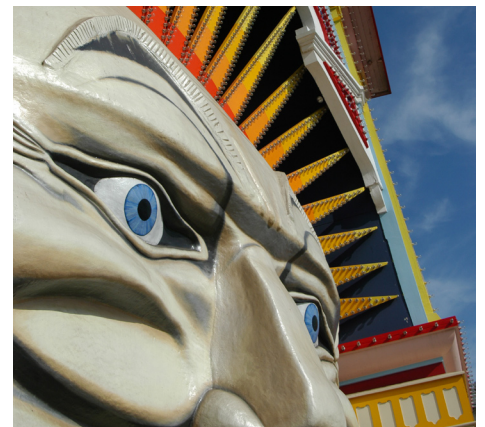
Entrance to Luna Park.