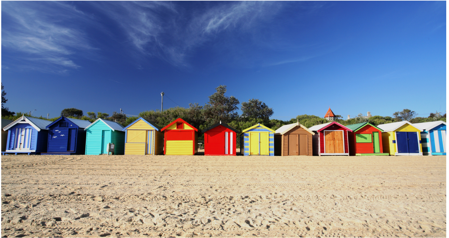
Brighton Beach.