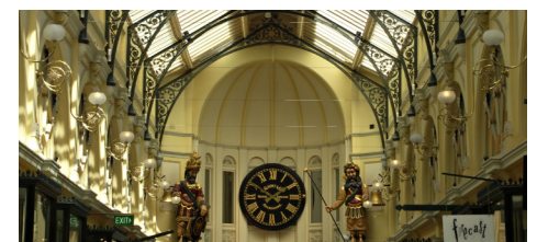
Shop at the Royal Arcade.

Melbourne and its surrounds has many trails for walking, riding or just getting away from it all. A variety of trails are offered, such as; The Bay Trail, Melbourne Heritage Walk, Royal Botanical Gardens Trail, Main Yarra Trail, Capital City Trail and many more. www.visitmelbourne.com