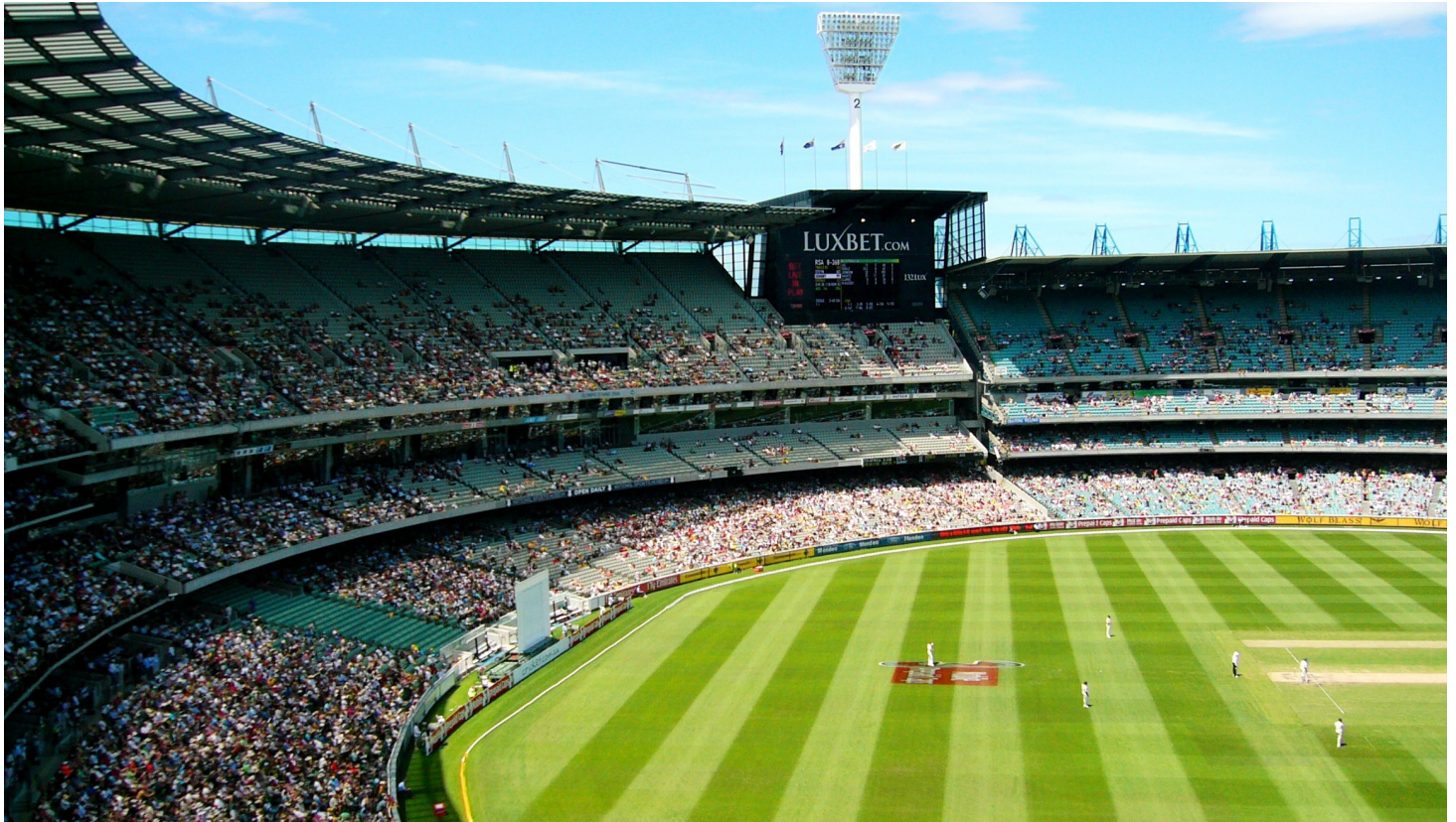
Melbourne Cricket Ground (MCG).